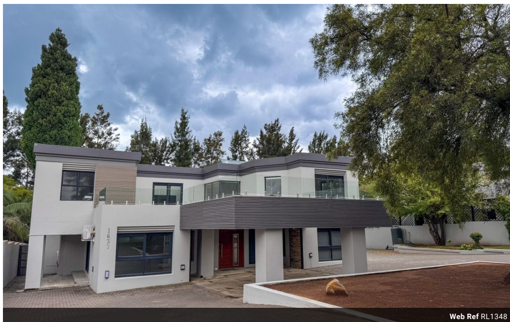
Web Ref RL1348

11 Mulberry Hill Office Park Broadacres Drive Cnr William Nicol Road Dainfern